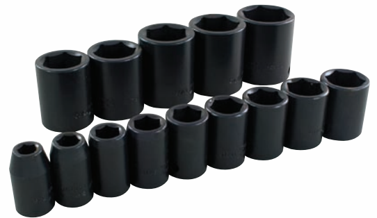
35064 14 Piece 6 Point Standard SAE Impact Socket Set

Contains: 3/8", 7/16", 1/2", 9/16", 5/8", 11/16", 3/4", 13/16", 7/8", 15/16", 1", 1 1/16", 1 1/8", 1 1/4"