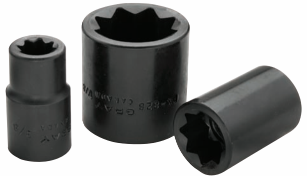
Double Square Standard Length Impact - Black Industrial Finish