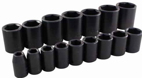
35066 16 Piece 6 Point Standard SAE Impact Socket Set

Federal Spec. CDA 39-GP-12M U.S. GGG-W-66OA ANSI B1072